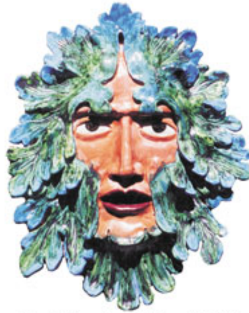
Hand Shaped and Painted Relief