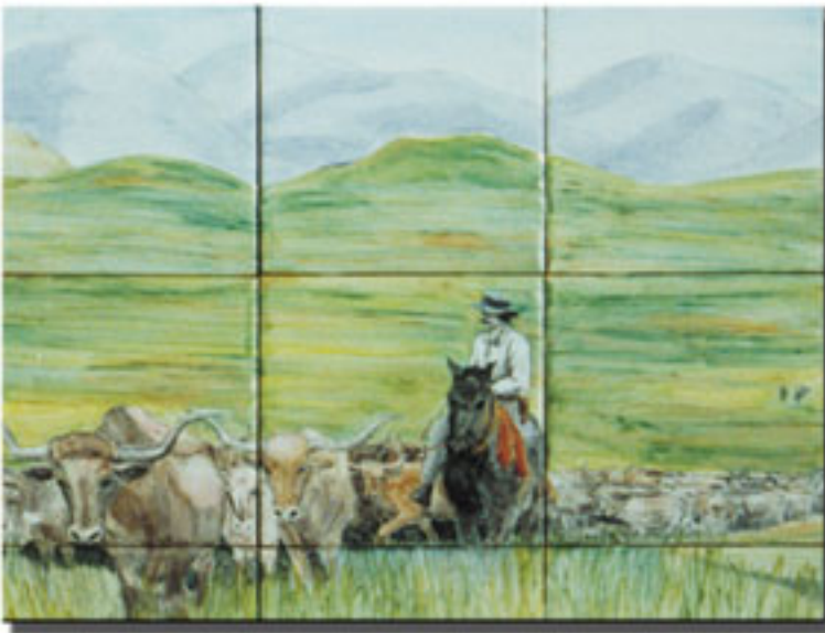
Fine Art on Tile by Bettina Elsner